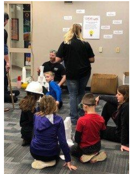
Figure 3 4th grade students enjoying Engineering Day with students from Cincinnati State College