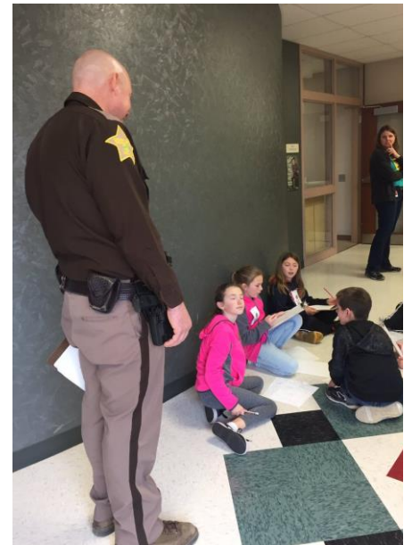
3 rd grade students using data to build 3-D bar graphs